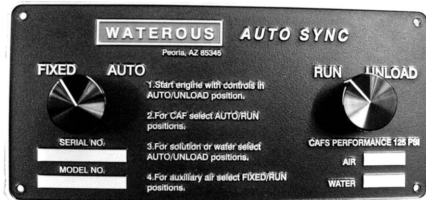
Figure 1 Manual Auto-sync Controls

NOTE: Monitor compressor instruments during any and all operations.